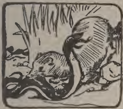
The Mongoose Jumped at the Snake.

“TELL us a story about some animal we’ve never heard of before,” asked Jack as daddy was about to begin his bedtime story.